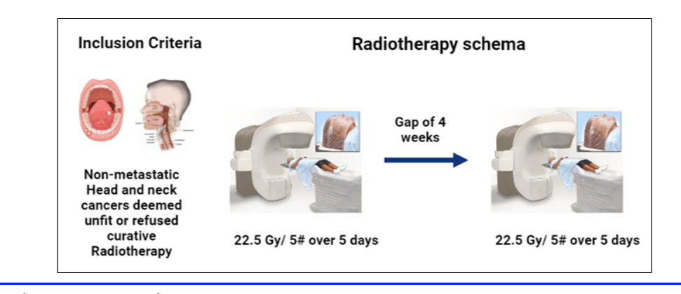
Figure 1. rt Schema Representation

We analysed a total 144 patients with non metastatic HN cancers who were treated with a palliative intent from January 2014 to January 2020. Of these, 84 patients were