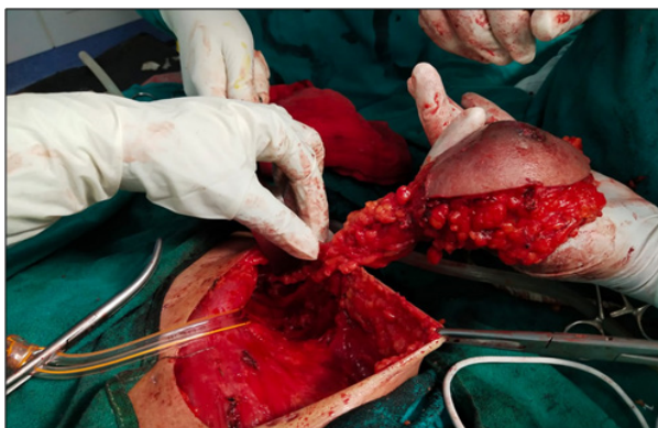
Figure 2. Frontal View of Specimen Taken after Modified Radical Mastectomy of Left Breast