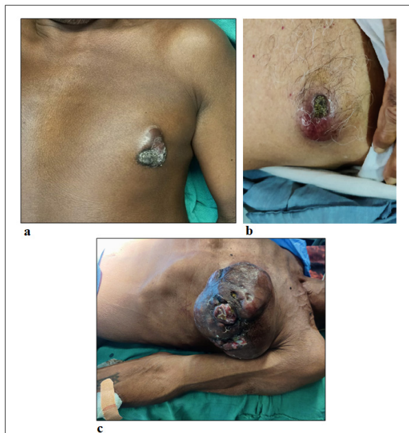
Figure 1. Frontal View of Different Presentations of Patients. a, With nipple environment; b, Without nipple environment; c, Advanced stage cancer

In my study, Male breast cancers occurred later in life with late stage and more ER PR receptor-positive tumours. The Median age being 58.54 years. Family history was found positive in one case. The average Mean diameter of lump was 8.77 cm (range: 3-20 cm) and tumor was predominantly on the left side (72.72%). The Average diagnosis delay for patients was 6.66 months. According to TNM classification 10 patients presented at T4 stage (90.90%) and one patient presented at T3. Axillary nodal involvement was seen in 72.72% of cases. Three patient was Node negative (27.27%) and N1 was