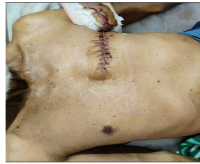
Figure 3. Frontal View of Scar Following Modified Radical Mastectomy Left Breast

seen in 6 cases (54.54%), while N2 was seen in 2 case (18.18%). Histopathological finding was infiltrating ductal carcinoma in 9 cases. (81.8%), One case was ductal carcinoma in situ and one was spindle cell carcinoma. Hormone receptors (ER/PR) was positive in 81.81% cases. Rest patients were not financially supportive for the test. Neoadjuvant chemotherapy with CAF regimen followed by Modified radical mastectomy followed by adjuvant Chemotherapy was given to 7 patients. Neoadjuvant chemotherapy with CAF regimen followed by Modified radical mastectomy and axillary lymph node sampling followed by adjuvant Chemotherapy was given to 2 patients One patient underwent mastectomy and one underwent WLE (Table 1).