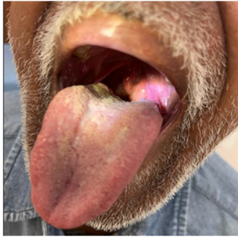
Figure 1. Clinical Picture Showing Left Tonsillar Swelling.

Suggestive of Diffuse large B cell lymphoma – germinal centre type (Figure 2). FDG PET CT scan showed as FDG avid soft tissue mass lesion is noted involving left para-oropharyngeal / tonsillar region measuring 3.1 x 3.8 x 6.2 cm with SUV max 10.7 & FDG avid left cervical level II lymph node measuring 1.05 x 0.6 x 1.4 cm with SUV max 4.9 (Figure 3). No evidence of metabolic active disease in rest of the body. Bone marrow aspiration & biopsy showed no evidence of infiltrative disorder. Serum LDH was 129 U/L. Hence he was diagnosed as Primary Extra nodal NHL - localized DLBCL of left tonsil stage II E. He was very high risk candidate for chemotherapy with respect to elderly age, multiple comorbidities, history of covid pneumonia with lung damage in CT scan, Ki 67 – 90% so high possibility of tumor lysis syndrome; hence he was considered for radical radiotherapy with the consent of patient & their attenders. He received external beam radiotherapy with 6 MV photon using Tomotherapy (Helical IGRT) technique with Radixact X9 machine to a dose of 50.4 Gy in 28 fractions @ 1.8 Gy per fraction, 5 days a week from Monday to Friday. During the treatment he had symptomatic relief. He tolerated the treatment well. He responded to the radical radiotherapy well & now he is on regular follow up.