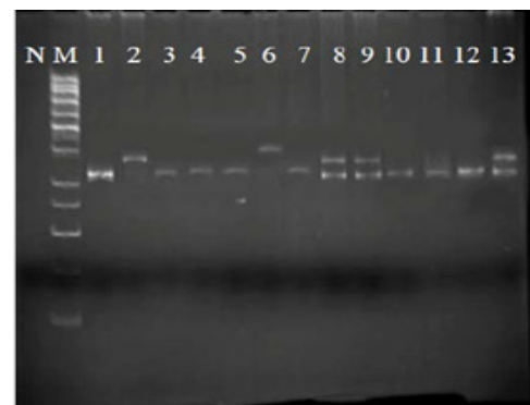
Figure 1. ITC Mutation in Flt3 Gene in Different Subgroups of Acute Leukemia Patients; N, Negative Control; M, Marker

As indicated by the marker in Figure 1, pieces 328bp are observable, which are pertinent to exon 11 and 12 and intron 11 of flt3 gene. The above samples belong to different sub-categories of FAB category and among them, column two represents AMP patients-M3; columns six and eight represent Early pre B cell patient with mutation; column nine represents patient with AML-M2; and column 13 represents AML-M1 patient. In