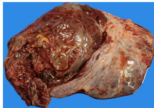
Figure 1. Large Tan Yellow Solid Mass with Capsular Rupture

The patient underwent planned laparotomy, revealing a solid mass originating from the right ovary with capsular rupture, measuring approximately 17x15x18 cm. Additionally, tumor deposits were observed on the omentum, and peritoneum (including over the sigmoid and bladder peritoneum), with the largest deposit measuring 3x2 cm. Pelvic and para-aortic lymph nodes were not enlarged. Right salpingo-oophorectomy, infracolic omentectomy, and removal of multiple peritoneal deposits