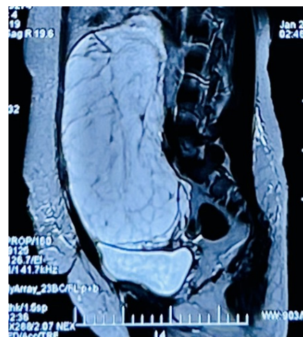
Figure 3. T2 Weighted CEMRI with Complex Solid Cystic Mass Measuring 14x15x12 cm Originating from the Right Adnexa.

Ovarian granulosa cell tumors (GCTs) are infrequent neoplasms known for their indolent course and a favourable prognosis. Recent studies have highlighted a link between these tumors and mutations in the Forkhead box L2 gene. This gene plays a critical role in ovarian development,