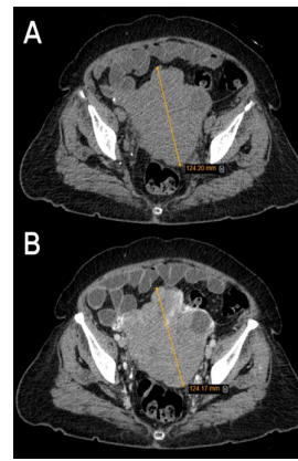
Figure 1. Abdominal and Pelvic Computed Tomography Scan without (A) and with contrast (B): an extending solid mass with lobulated borders (maximum axial diameter equal to 12.4 cm) extended over the uterus into the Vesicouterine pouch and invaded to the left partial peritoneum, but there is no evidence of invasion to the bladder, and also a mass adhered to the distal sigmoid.

Bone marrow biopsy (BMB) and aspirate (BMA) were performed to rule out causes relative to bone marrow involvement. BMB showed 50% cellularity (appropriate for the patient's age), mildly increased megakaryocytes with normal morphology, and normal maturation of erythroid and myeloid lineages. Also, there was no