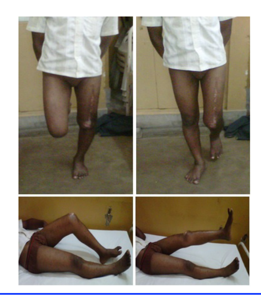
Figure 4. Orthopaedic Outcome

Extracorporeal irradiation as an useful, costeffective alternative during limb salvage in bony malignancies had been reported by various studies. The studies by Davidson et al. [15], and Poffyn et al. [16] were the largest in the literature of ECI that had treated 50 or more patients. Ours is the next largest study that had included 49 patients of primary malignant bone tumours managed with ECI. Davidson et al. [15] in study treated 50 patients with