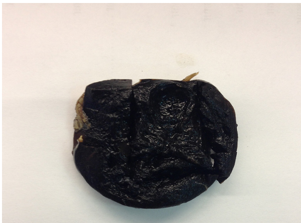
Figure 1. The Section Surface was Completely Dark Brown-black and Spongy in Appearance

In the sections prepared from the lesion, there were organoid patterned cell islands separated by fibrovascular septa. The islands consisted of oval and polygonal cells with a hyperchromatic nuclei and granular cytoplasm (Figure 2A). Brown pigment was evident in most of the tumor cells (Figure 2B).