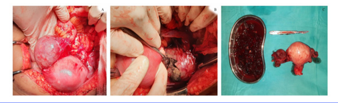
Figure 2. Abdominal Recurrence of Melanoma A-Right Ovary with Deposits of Melanoma B-Black Melanocytic Materials in Left Adnexa C-Debulked Tumor Deposits of Lymph Nodes and Specimen of Uterus and Ovaries

Hysterocolpectomy was performed as a combined abdomino-vaginal procedure where the abdominal approach involves hysterectomy similar to the radical hysterectomy to dissect up to the mid vagina and the vaginal approach completed the total excision of the vagina (Figure 3) [7]. Salpingo-oophorectomy was performed if not done before. Omentectomy was not done and none of the primary cases revealed macroscopic peritoneal metastatic deposits. Whether to do routine pelvic or groin node dissection was not standardized [10] and, here only one patient had bilateral pelvic and groin node dissection and found negative for lymph node metastasis. FNAC in another patient was also found negative. Colpectomy was the option for those who had