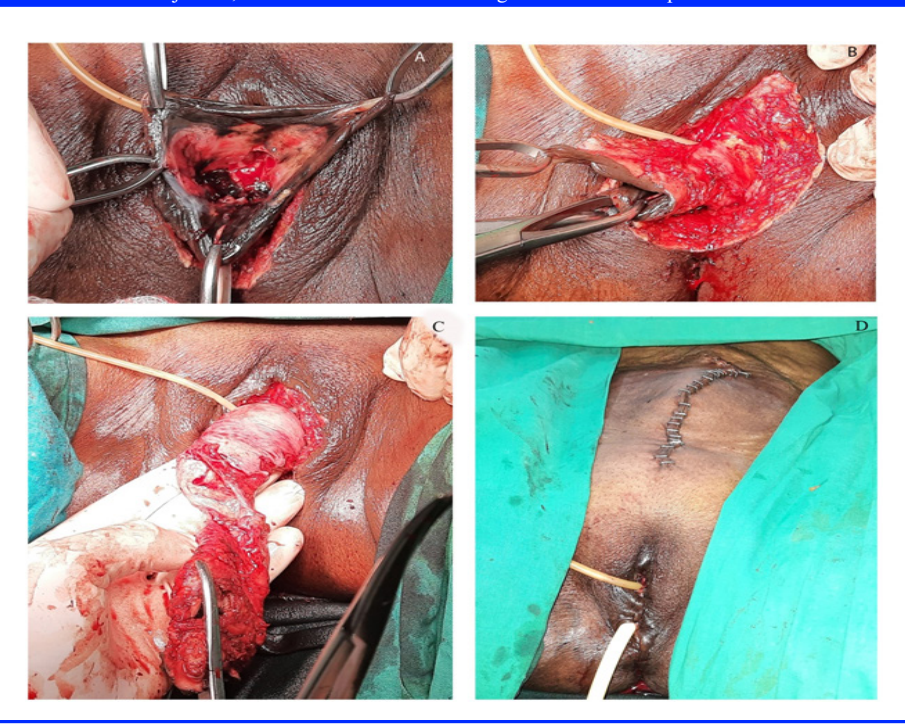
Figure 3. A Surgical Steps of the Vaginal Approach of Hysterocolpectomy. A-Incision of lower vaginal margin. B-dissecting the lower vagina. C- Delivering the uterus through introitus. D- Immediate post-surgical appearance

6 months postoperatively and patient 6 (Table 1) had the recurrence in the pouch of Douglas forming a mass and with no tumor recurrence in the upper abdomen or lungs.