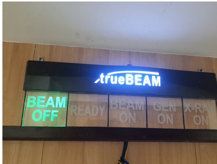
Figure 3. Warning Light

curve to limit neutron exposure at the entry. The bunker's back wall has a chiller connection whose primary purpose is to keep the LINAC cool.