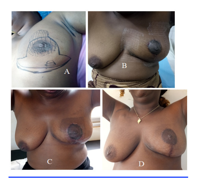
Figure 3. Superior Pedicle Oncoplasty for Lower Quadrant Carcinoma. A, Preoperative drawing of the patient in supine position. B, Breast appearance at 3<sup>rd</sup> day post-operative; C, Appearance of the breast one month postoperatively; D, Appearance of the breast one year after radiotherapy

In conclusion, oncoplastic breast surgery is possible in Ouagadougou. The techniques are diversified. The results are good both oncological and aesthetical. It provides