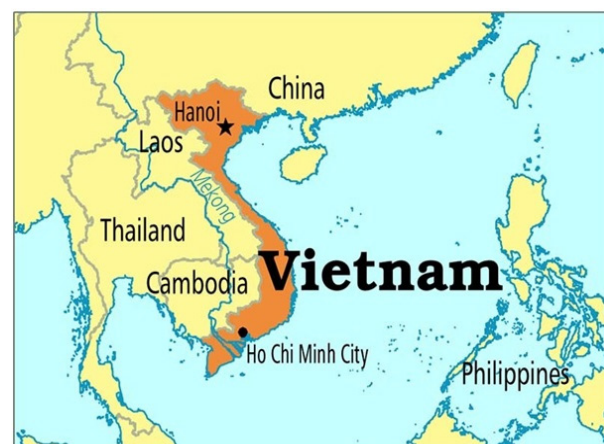
Figure 1. Map of Viet Nam.

Cancer case 2: a Sweden tourism aged 64 having