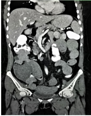
Figure 1. Contrast Enhanced CT Abdomen and Pelvis in Coronal Plane Shows Wall Thickening Involving Proximal Ascending Colon Causing Luminal Narrowing with Proximally Dilated Cecum.