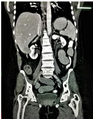
Figure 2. Contrast Enhanced Coronal Image of Abdomen Shows Hypo Dense Areas of Washout Noted in Segment VI of Liver with Infiltration of Right Kidney

chemotherapy. Post 3 cycles of palliative chemotherapy, disease progressed and hence further chemotherapy was deferred and offered best supportive care.